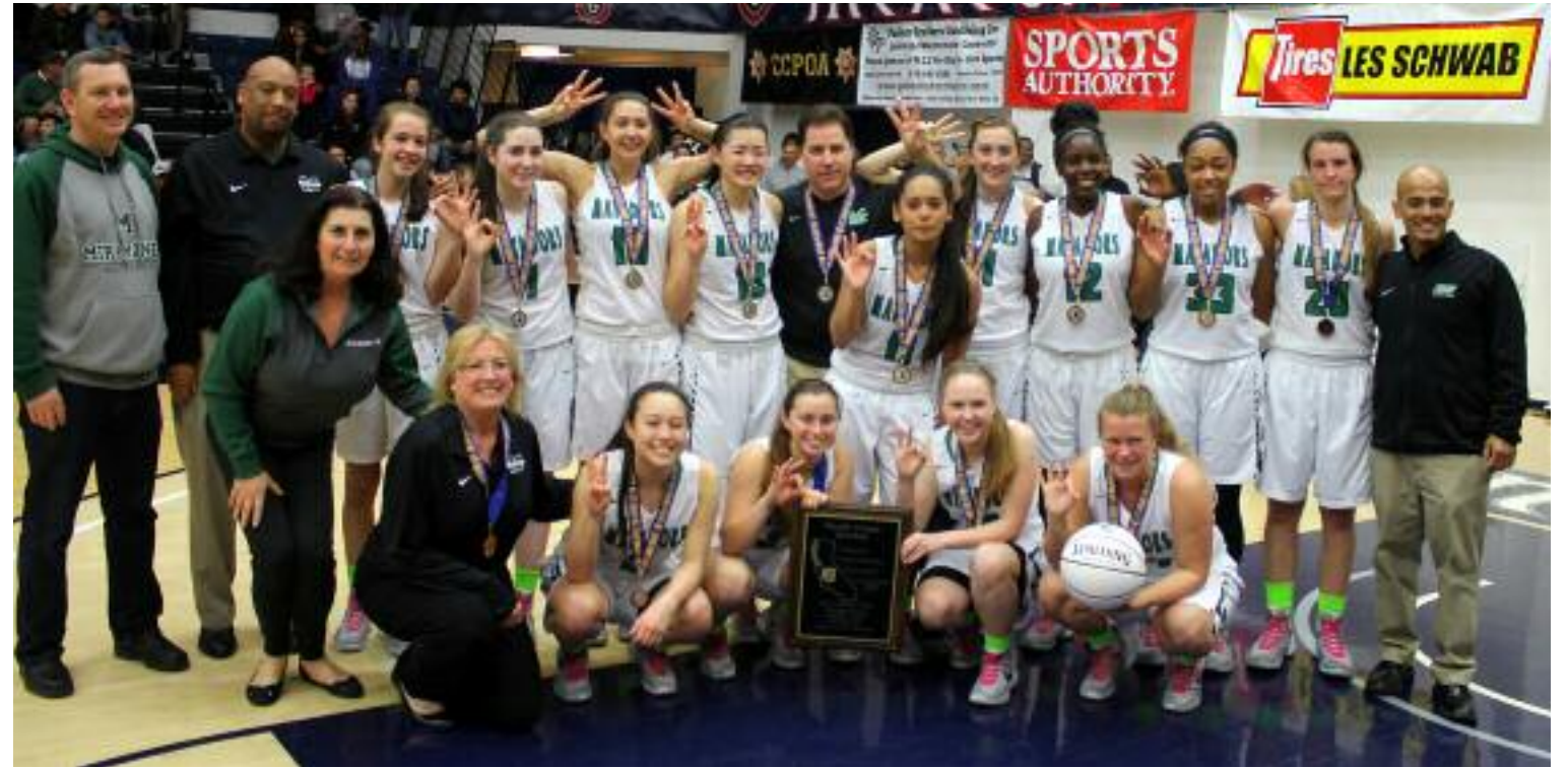
The Lady Mats won their third-consecutive NCS Division III title on Saturday and earned the No. 2 seed in the CIF Open Division tournament

team secured its third consecutive NCS Division III title on March 5, throttling Bishop O'Dowd 82-67.